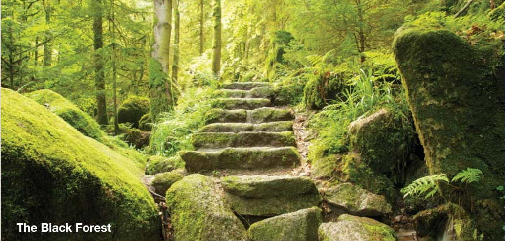
The Black Forest